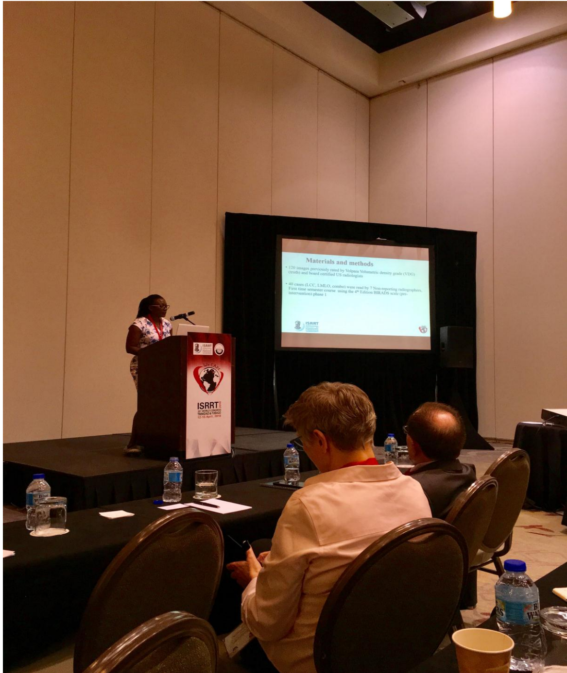
Making my presentation at the ISRRIT congress in Trinidad and Tobago